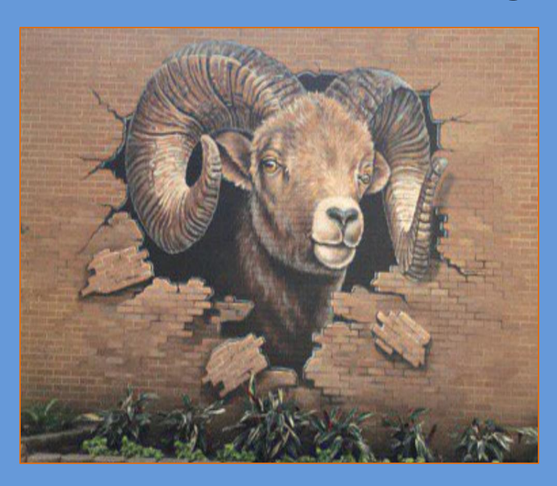
"Where Academics and Character Matter"